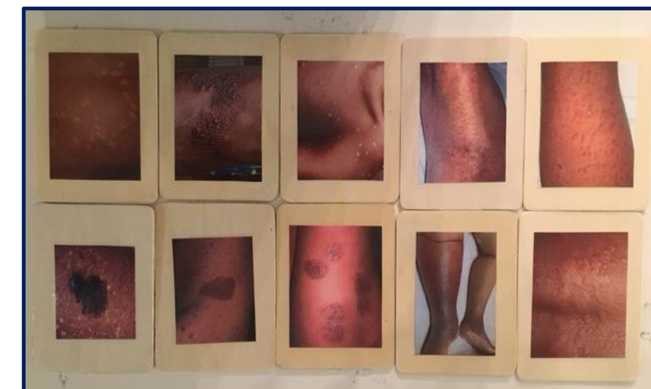
Figure 1. Simulated wounds